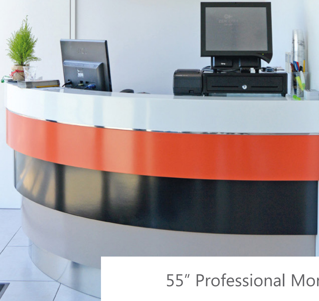
55" Professional Monitors